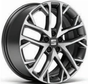
Dinamic 17" Machined XC+