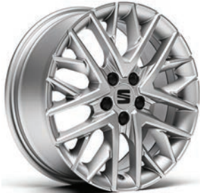
Design 16" XC