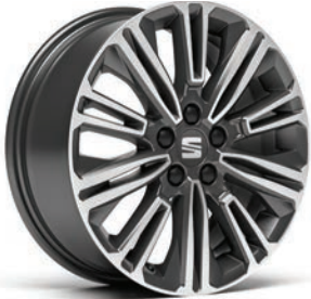
Design 16" Machined SE+