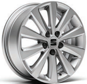
Enjoy 15" SE