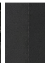
Dinamica Black - BX+PL7