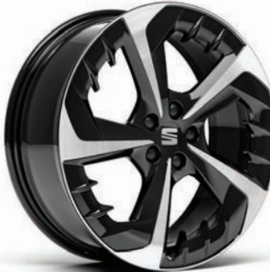
Performance 18" Machined FR FR+