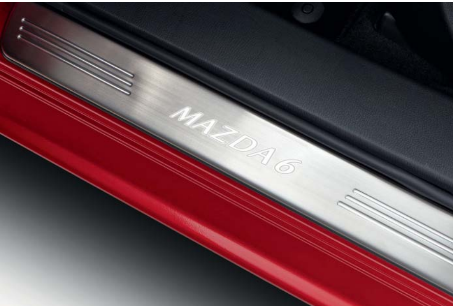
Illuminated scuff plates

Mazda has created thoughtfully designed accessories that perform seamlessly with your Mazda6.