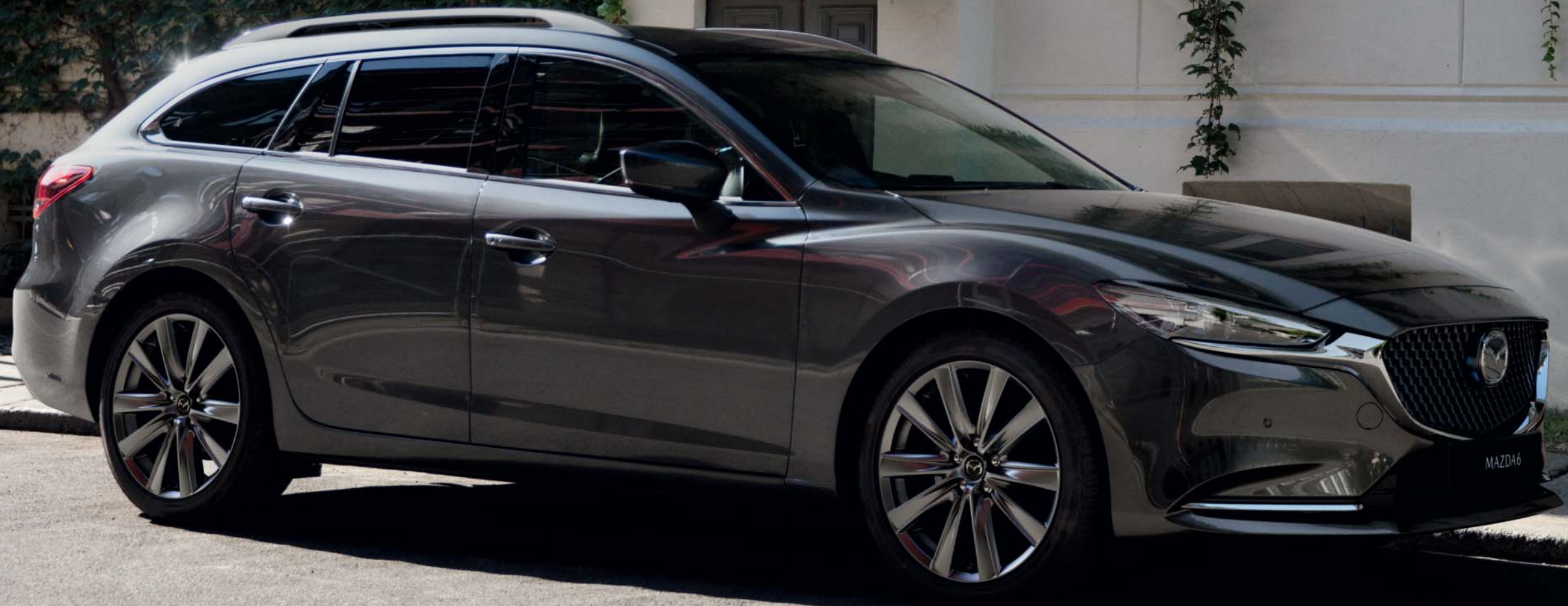
This image is showing a Mazda6 Tourer in optional Machine Grey. Some features are not available in Rep. of Ireland