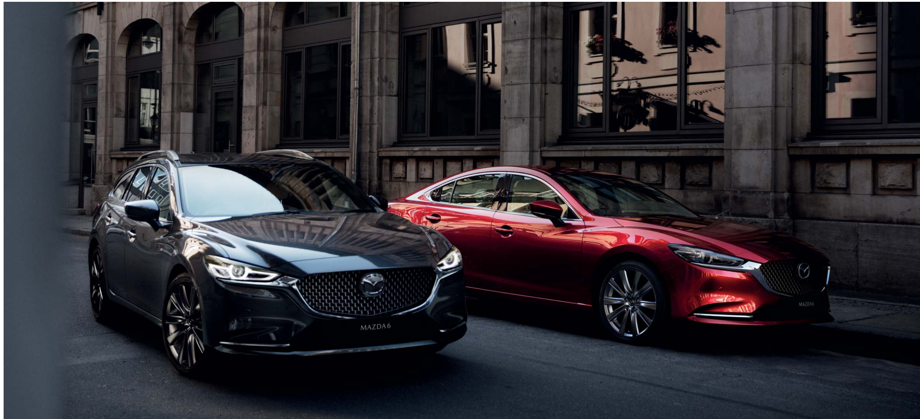
This image is showing a Mazda6 Tourer in optional Machine Grey and a Mazda6 Saloon Platinum LUX in optional Soul Red Crystal. Some features are not available in Rep. of Ireland.