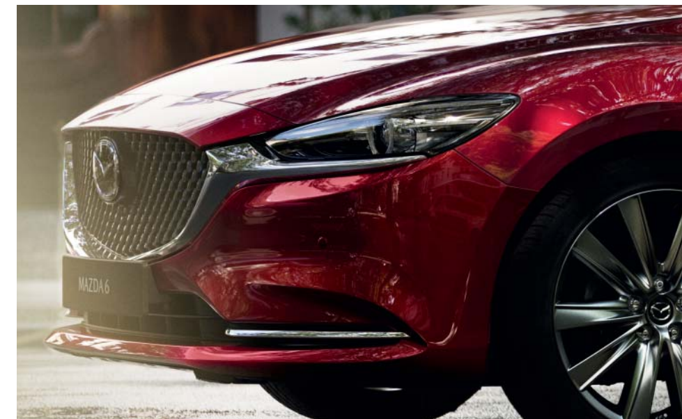
This image is showing a Mazda6 Saloon Platinum LUX in optional Soul Red Crystal.