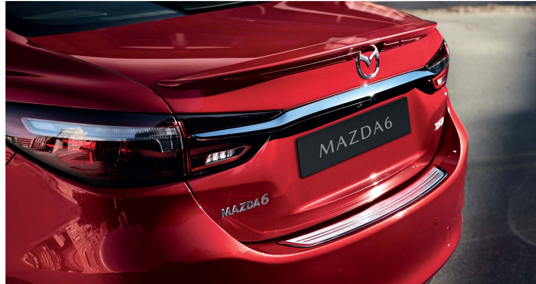
This image is showing an accessory lip spoiler.