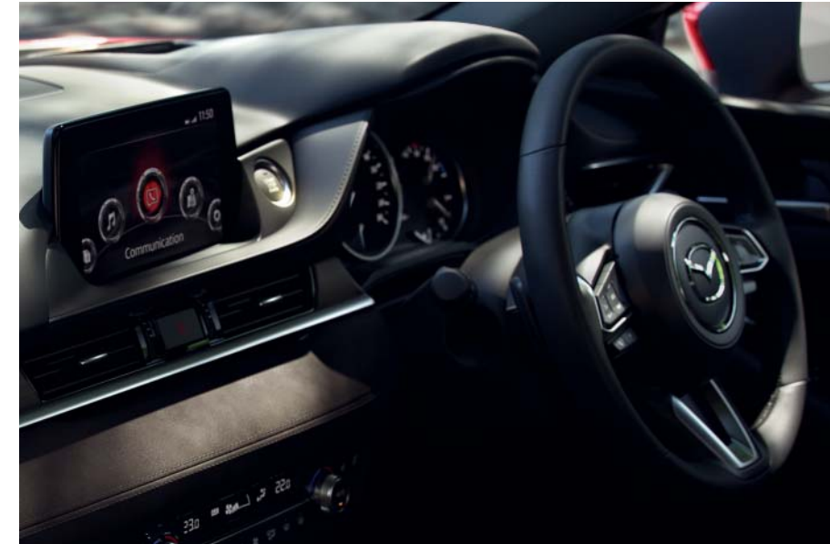
This image is showing a Mazda6 Saloon Platinum LUX in optional Soul Red Crystal