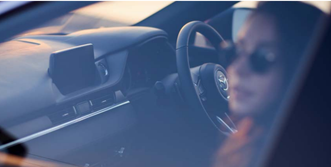
This image is showing a Mazda6 Saloon Platinum LUX in optional Soul Red Crystal

When it comes to first impressions, there are no second chances. With the Mazda6, we have taken our passion for cars beyond and created a car that knows no compromise. Its impressive design continues to excite you once you step inside and discover the luxurious and comfortable interior. An outstanding piece of art on wheels, the Mazda6 comes with a classy yet athletic look, giving it a firm and at the same time a sophisticated appearance, while the phenomenal agility and avant-garde safety features gratify the most demanding drivers. When it comes to craftsmanship, every single detail is designed and created with you in mind, all precisely executed by human hand. This is why everything inside the Mazda6 comes together to enhance the feeling of complete oneness between car and driver for unique driving experiences.