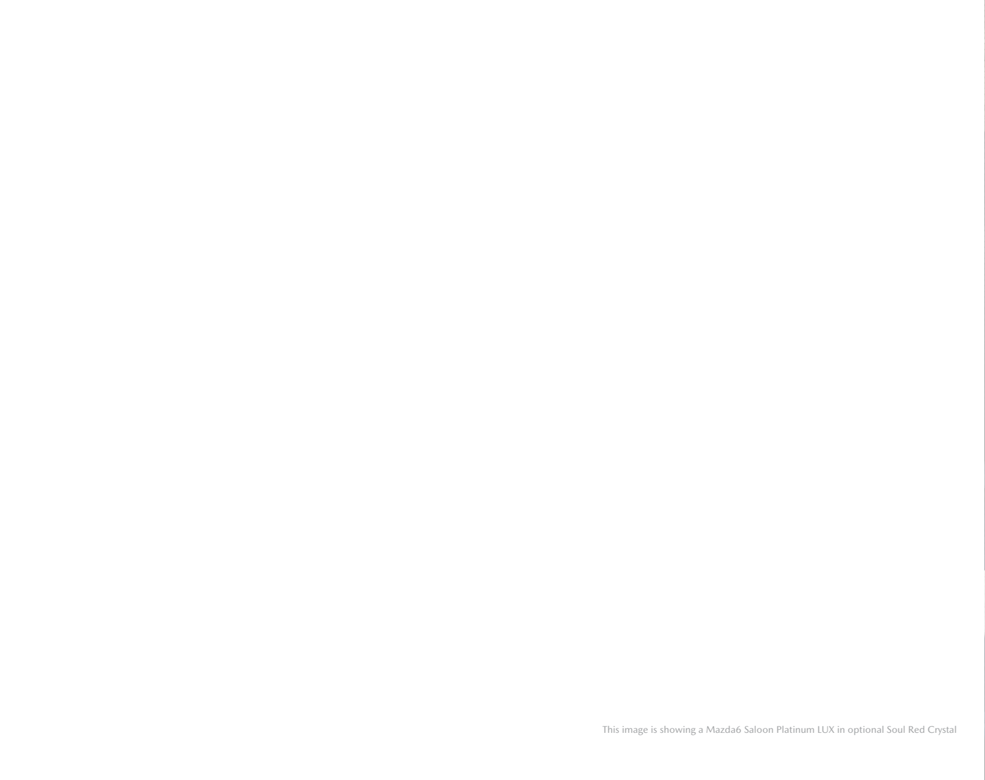
This image is showing a Mazda6 Saloon Platinum LUX in optional Soul Red Crystal