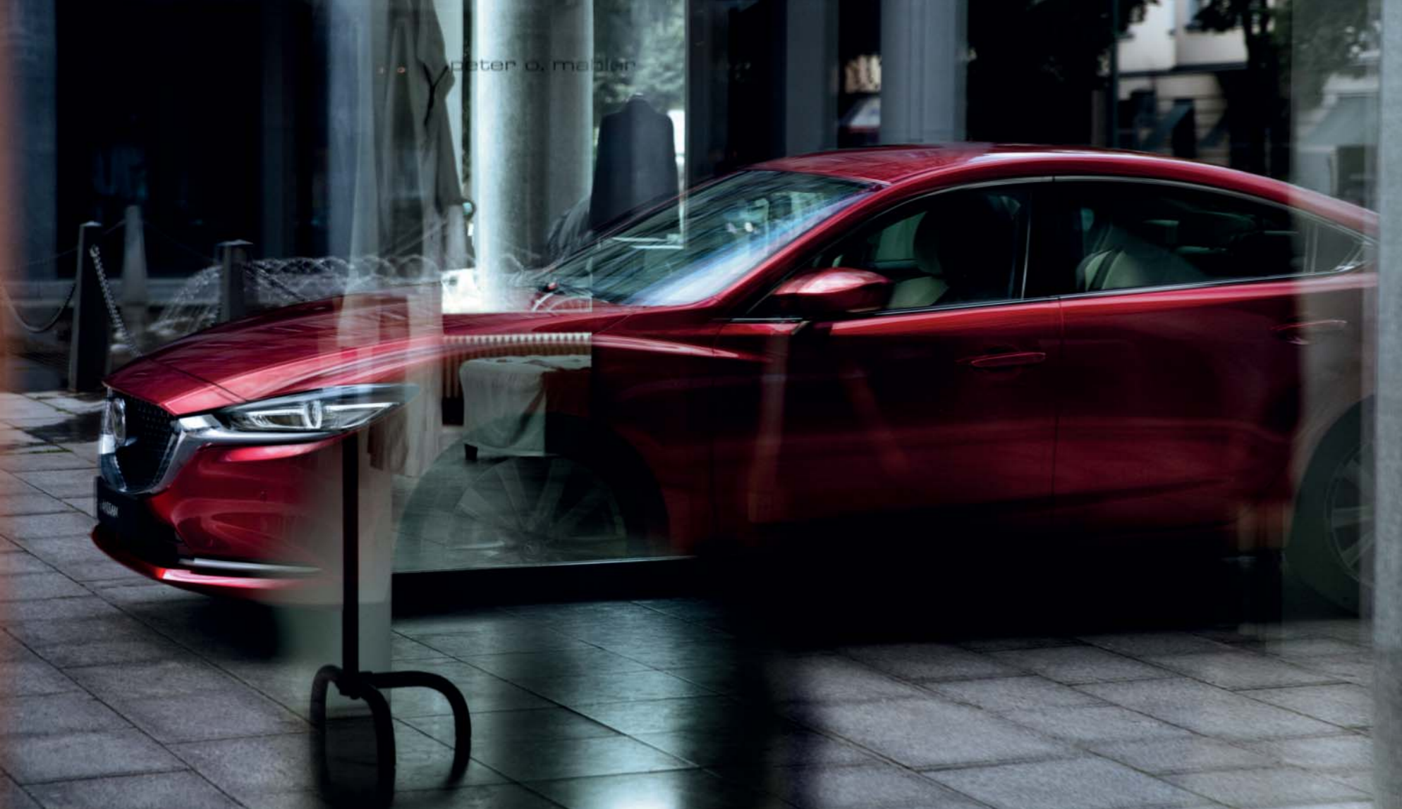
This image is showing a Mazda6 Saloon Platinum LUX in optional Soul Red Crystal