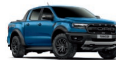
Ford Performance Blue Metallic body colour* (Ranger Raptor only)