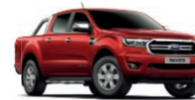
Copper Red Metallic body colour*