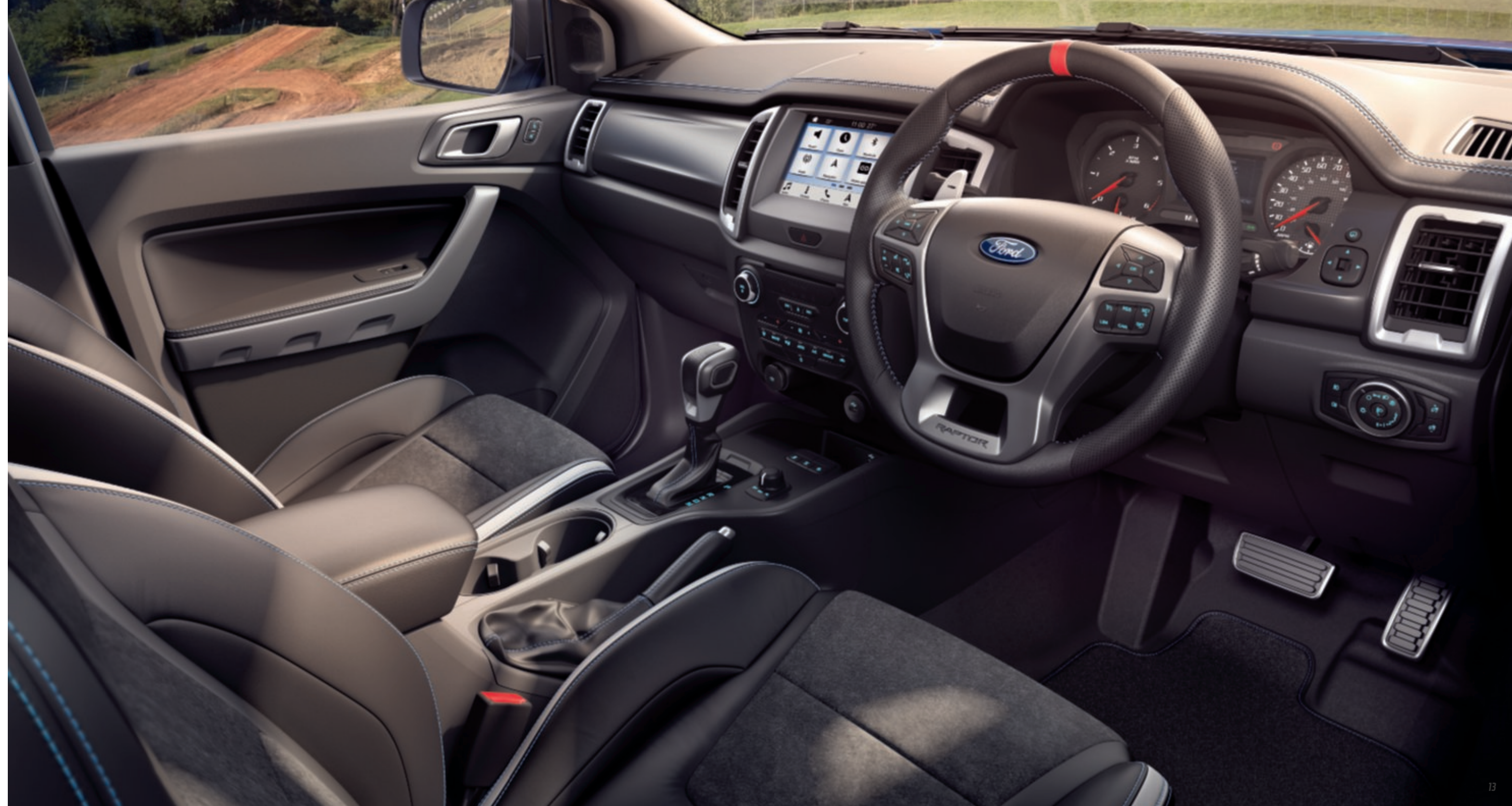
Model shown is a Ranger Raptor with 10-speed automatic transmission (standard).

From now on, you will view every road and every drive from an entirely new perspective.