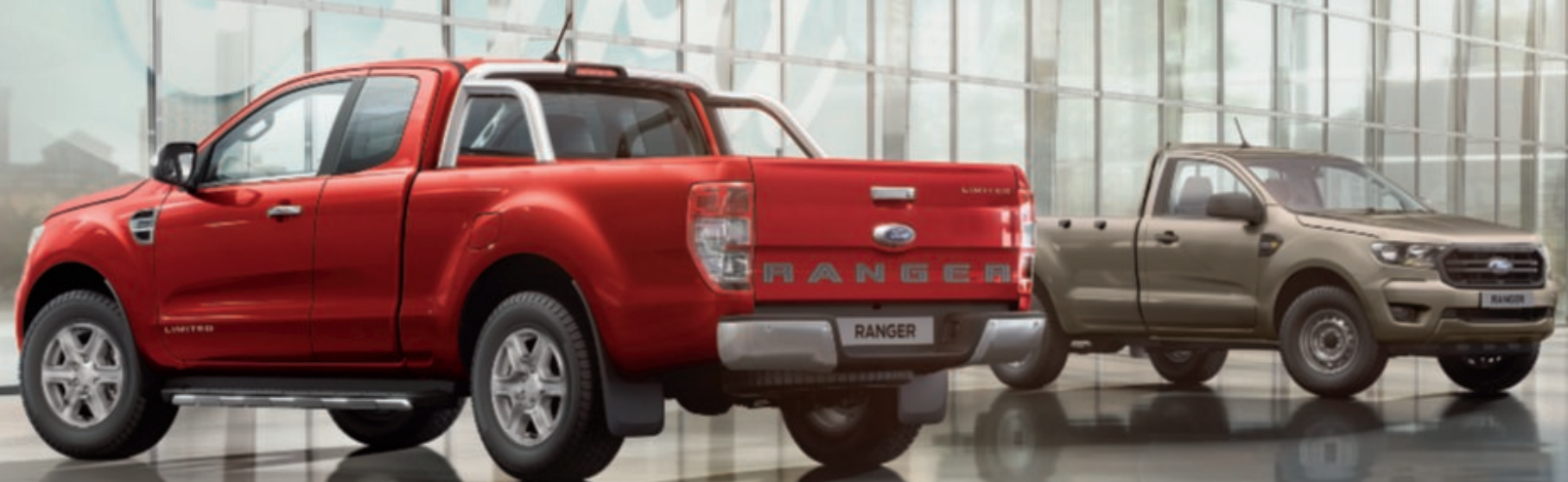
Left: Model shown is a Super Cab Wildtrak in Copper Red metallic body colour (NA in ROI).