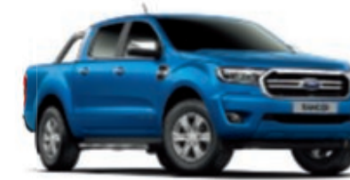
Blue Lightning Metallic body colour*