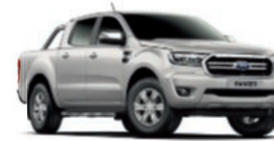
Moondust Silver Metallic body colour*