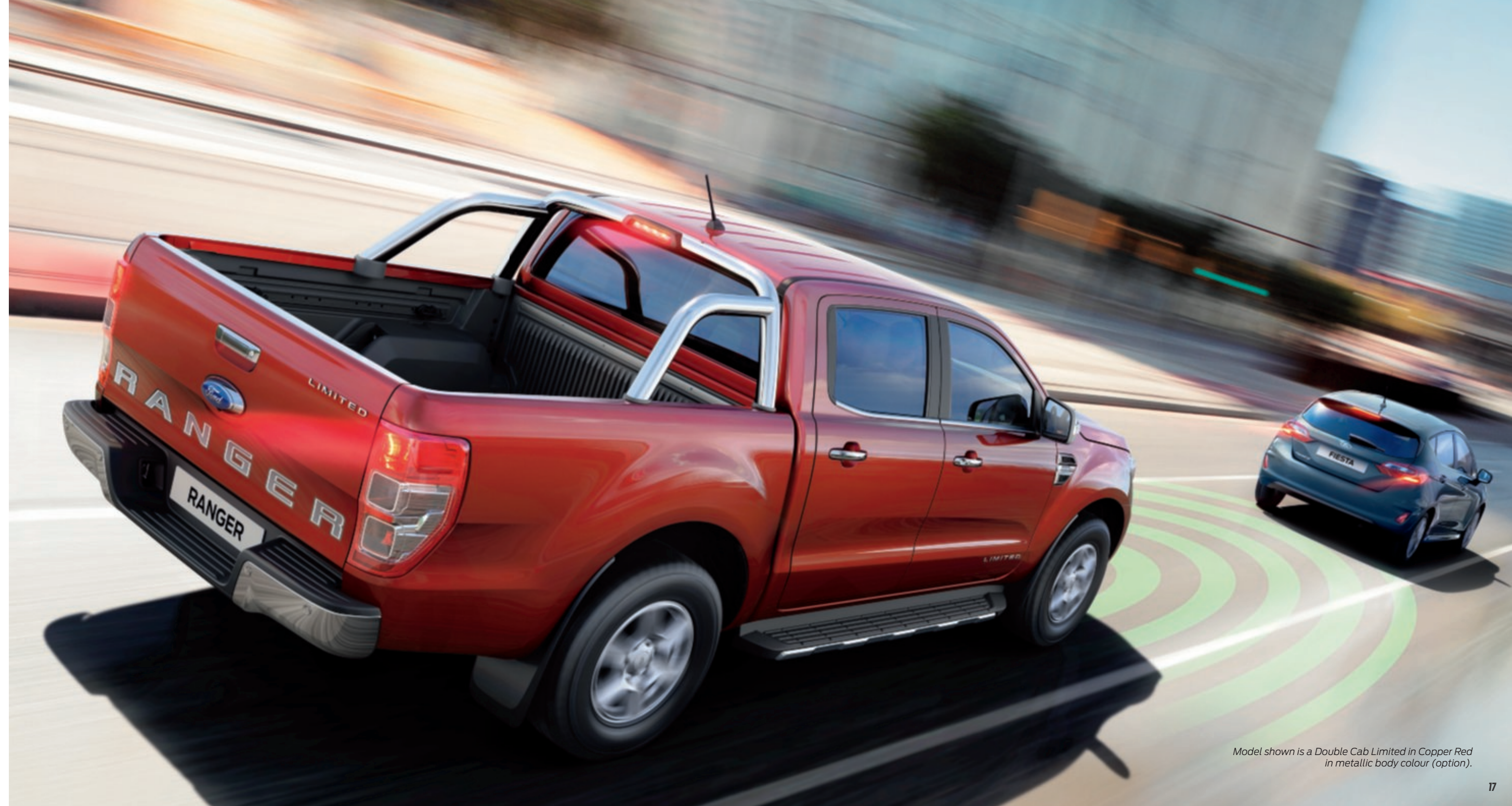
Model shown is a Double Cab Limited in Copper Red in metallic body colour (option).