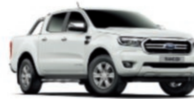
Frozen White Solid body colour