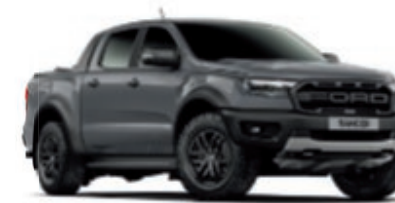
Conquer Grey Solid body colour (Ranger Raptor only)