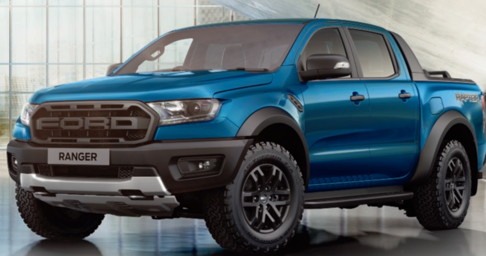
Above: Model shown is a Double Cab Raptor in Ford Performance Blue metallic body colour (option).