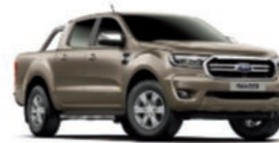
Diffused Silver Metallic body colour*