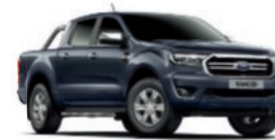
Sea Grey Metallic body colour*