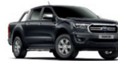
Shadow Black Mica body colour*