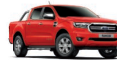
Colorado Red Solid body colour