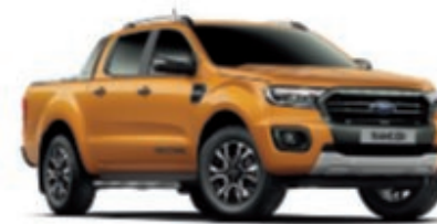
Sabre Orange Metallic body colour* (Wildtrak only)